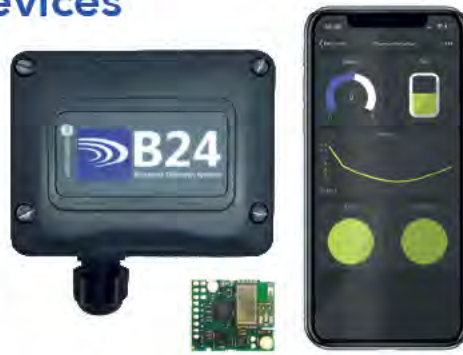
Transmitter OEM Module Free App

With a wide sensitivity range to suit many sensors types.